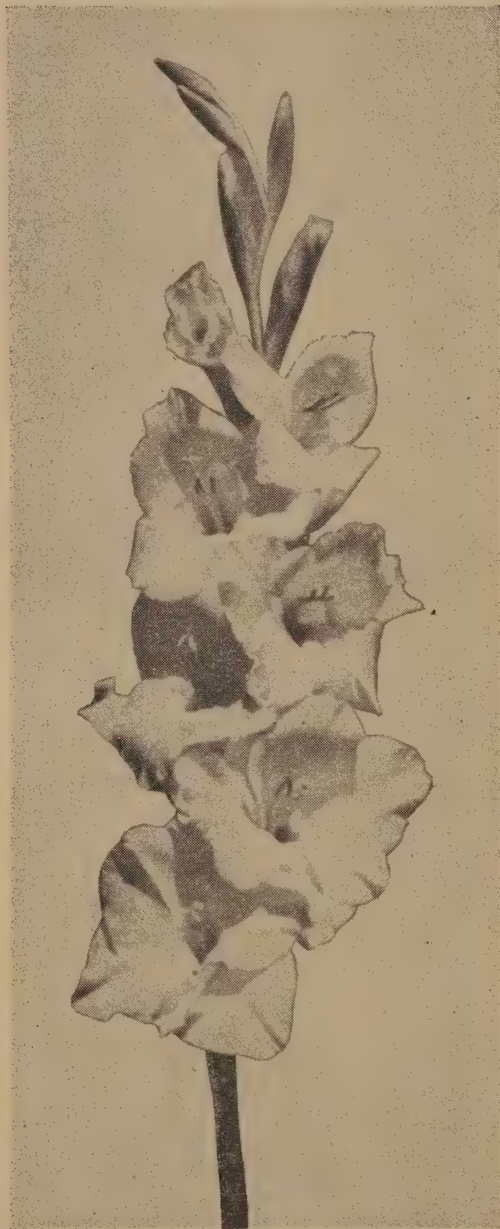
Bulblet spike of Silver Wings Yes bulblets often bloom

M. 3 for 50c; 12 for $1.75; 25 for $3.25